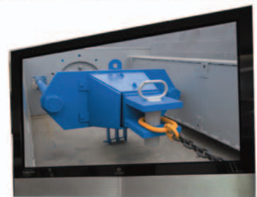
50" HD Monitor with remote cameras