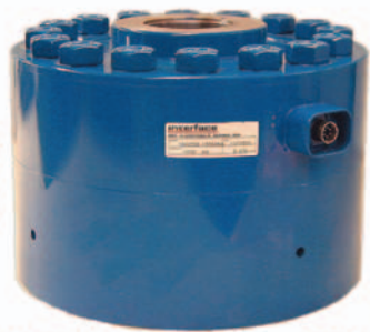
500K LB Electronic Load Cell

Accuracy to .05% High Output - to 4 mV/V Low Deflection Shunt Calibration